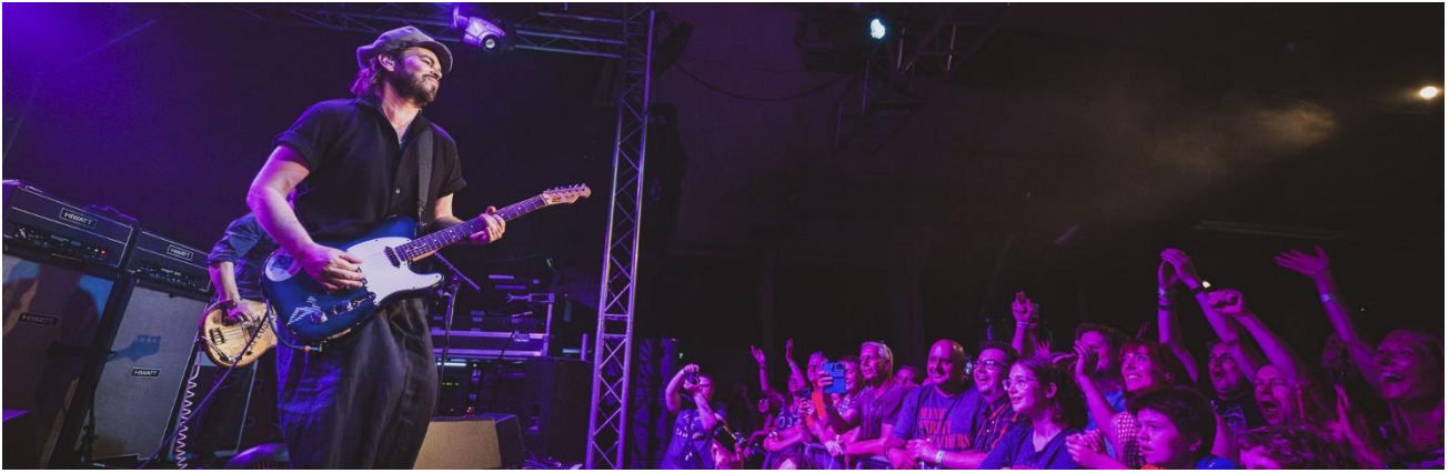
SUPERGRASS, FRI 11 JULY 2025